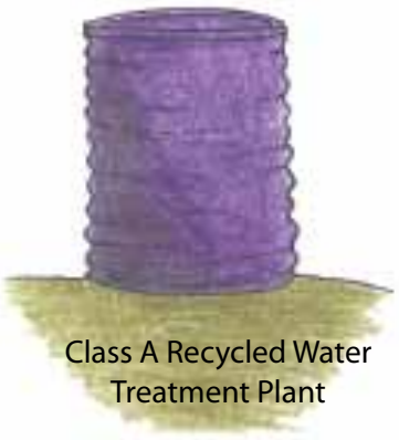
Class A Recycled Water Treatment Plant