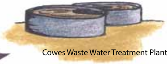
Cows Waste Water Treatment Plant