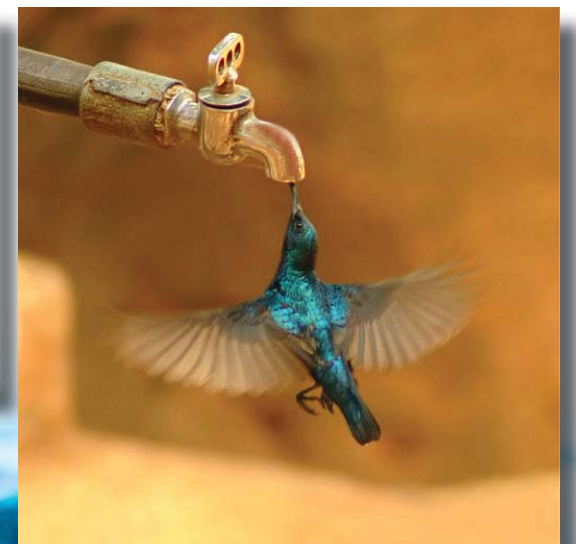
2011 finalist - Mukesh Srivastava

Entries close at 5pm on Friday 20 July 2012