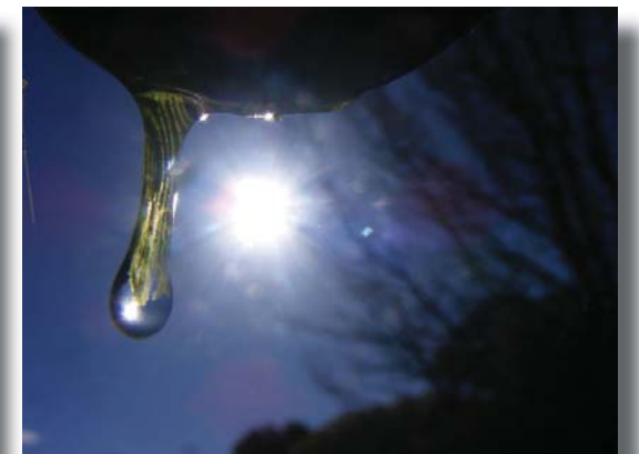
2011 finalist - Emma Wilkie - Lifeblood