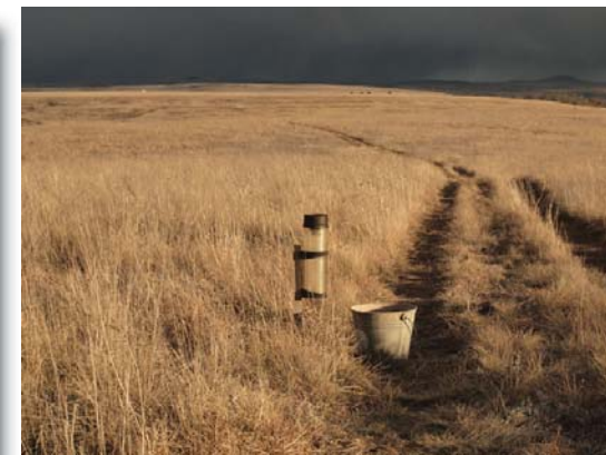
2011 finalist - Ross Lawley - Tracking the Rain